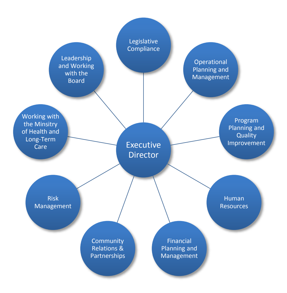
Diagram 1: Executive Director Roles

<u>Diagram 1</u> below outlines the roles of the Executive Director.