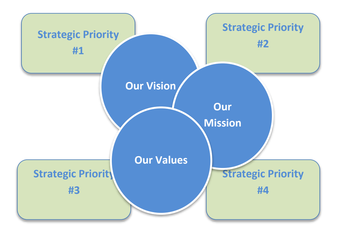
Diagram 2 – Strategic Plan outline