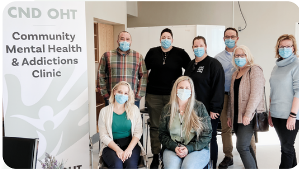
C-MAC staff celebrate the opening of the clinic.